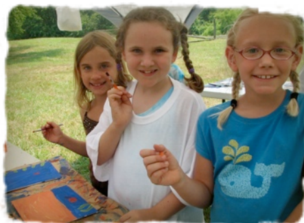
Arts & Crafts time

Campers will need to bring a sack lunch and water bottle to Day Camp each day. Drinks and snacks will be provided. Each day will begin at 9:30am and end at 4:30pm. Friday will have an earlier pickup time coinciding with camper celebration where we will have a slide show from the week. More information and a schedule of the week will be provided at camper check-in.