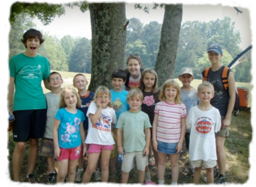
Three LIT's with their Day Campers

Glisson Day Camps are run primarily by participants in our Leader-In-Training (LIT) program. LIT's are trained by experienced Glisson staff (LIT directors) and accompanied by veteran camp counselors. As part of the Glisson Leadership Program, being an LIT is the first step to becoming a Glisson counselor. The LIT program is divided into two parts. The first week is spent training to be an effective leader and camp counselor. In the second week, the LIT's put all their training to work when they run a week-long Day Camp at a local church. Each LIT participant has had to apply, interview, and be accepted by the program. The 2009 LIT-led Day Camps allowed Camp Glisson to serve more campers in more places, while also offering our future staff a chance to show their leadership ability. We look forward to even better experiences in Summer 2010!