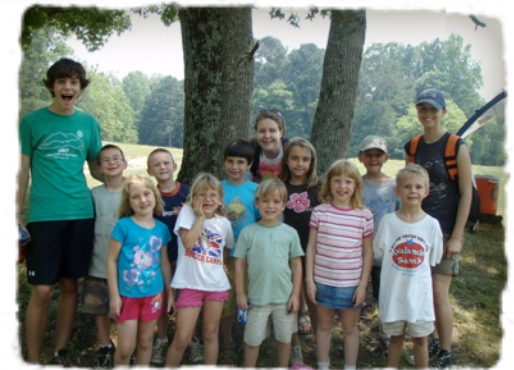
Three LIT's with their Day Campers

Glisson Day Camps are run primarily by participants in our Leader-In-Training (LIT) program. LIT's are trained by experienced Glisson staff (LIT directors) and accompanied by veteran camp counselors. As part of the Glisson Leadership Program, being an LIT is the first step to becoming a Glisson counselor. The LIT program is divided into two parts. The first week is spent training to be an effective leader and camp counselor. In the second week, the LIT's put all their training to work when they run a week-long Day Camp at a local church. Each LIT participant has had to apply, interview, and be accepted by the program. The 2009 LIT-led Day Camps allowed Camp Glisson to serve more campers in more places, while also offering our future staff a chance to show their leadership ability. We look forward to even better experiences in Summer 2010!