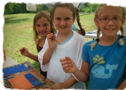
Arts & Crafts time

Campers will need to bring a sack lunch and water bottle to Day Camp each day. Drinks and snacks will be provided. Each day will begin at 9:30am and end at 4:30pm. Friday will have an earlier pickup time coinciding with camper celebration where we will have a slide show from the week. More information and a schedule of the week will be provided at camper check-in.