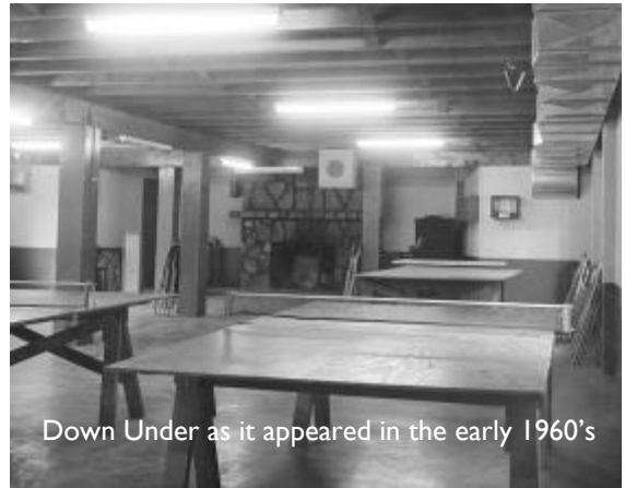
Down Under as it appeared in the early 1960's